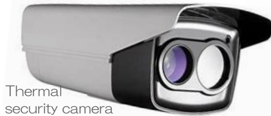
Thermal security camera

STEP ONE: Use thermal imaging cameras to quickly scan larger groups