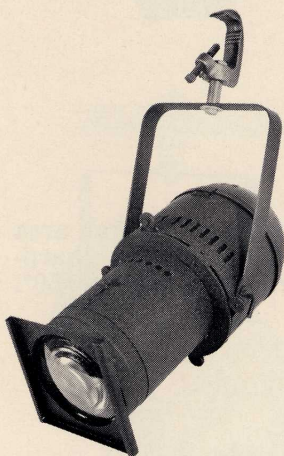
Z6-Y With yoke only Z6-C With pipe clamp (as illustrated)