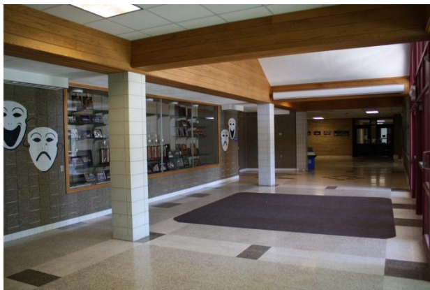
Lobby and Box Office