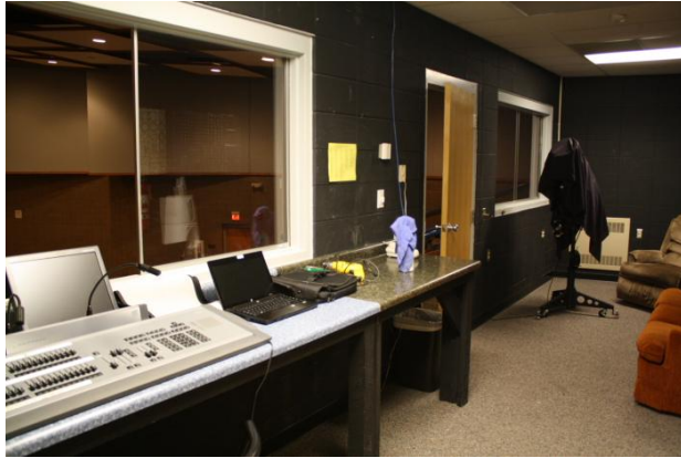
Lighting Control Booth

2073 County DK, Brussels, WI 54204 • 920.825.7311, ext. 321