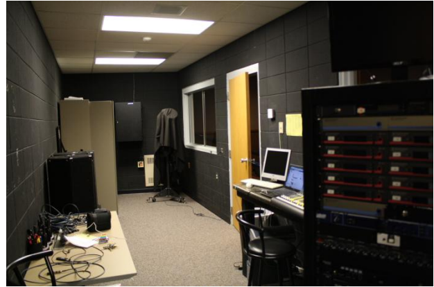
Sound Control Booth