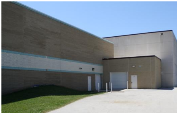
Driveway to Loading Door