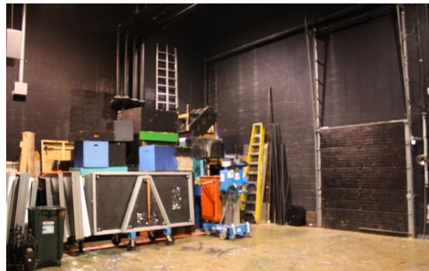
Scene Shop and Loading Door